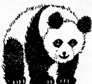
Regd. Trade Mark

Everyone adores them they're so so gay and colourful in a variety of designs:— stripes, spots, checks and tartans. Also self colours in satins, taffetas, failles and petershams. Ask for "Panda" and know you are buying the best.