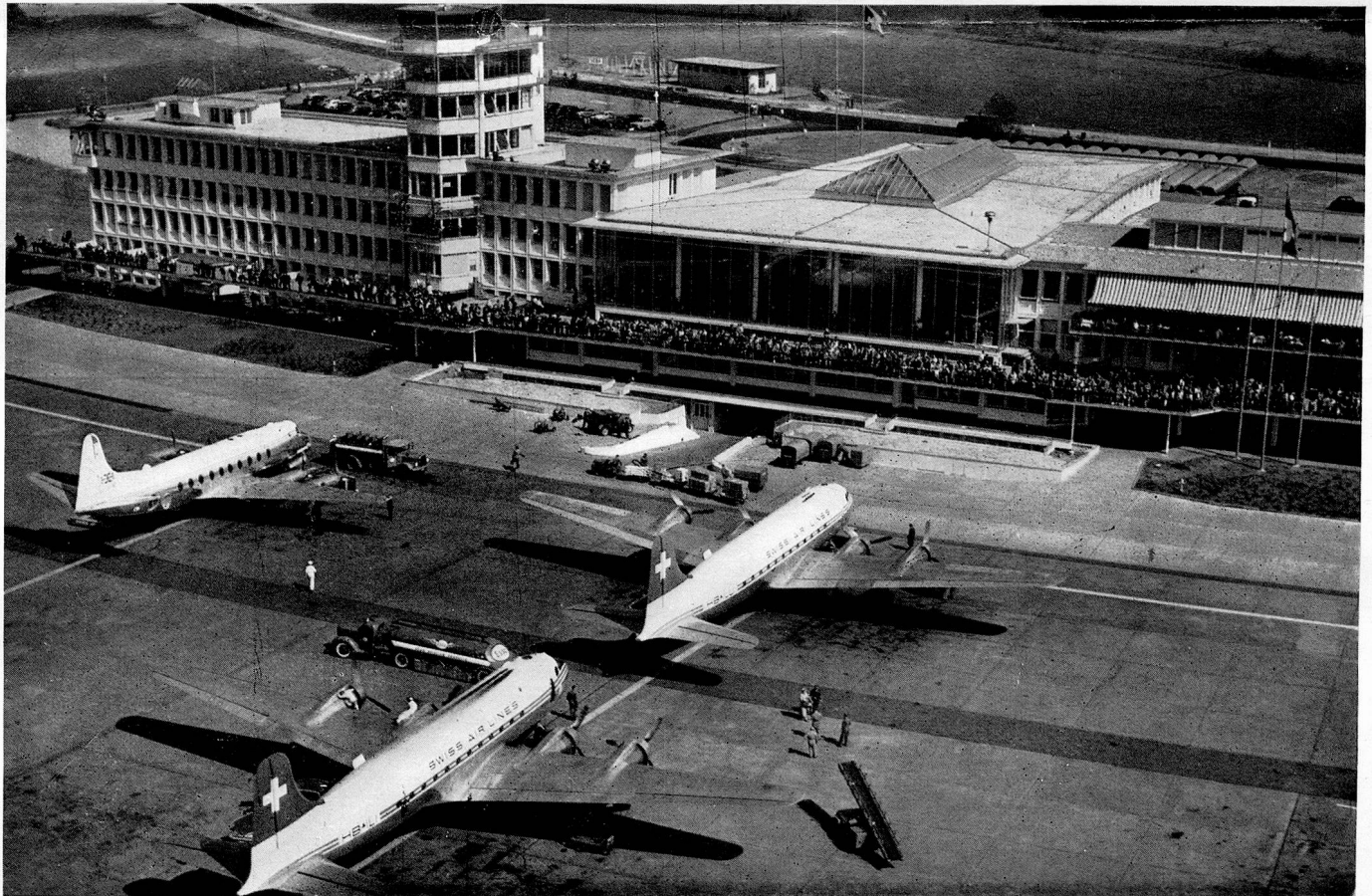
KLOTEN AIRPORT — ZURICH.

been quickening, they took decisions of courage and sound business sense which improved not only the internal efficiency of the organisation but safeguarded the very existence of Swiss commercial aviation. At a time when the future held many uncertainties, emphasis was placed on the development of long-haul traffic which produced better results in terms of revenue and aircraft utilisation. The equipment programme has always reflected the Management's desire to operate the most modern aircraft on all routes, but without neglecting the particular requirements of any part of the network.