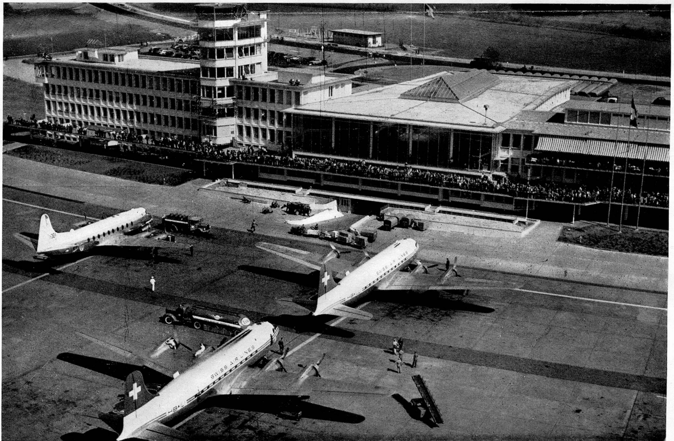
KLOTEN AIRPORT — ZURICH.

been quickening, they took decisions of courage and sound business sense which improved not only the internal efficiency of the organisation but safeguarded the very existence of Swiss commercial aviation. At a time when the future held many uncertainties, emphasis was placed on the development of long-haul traffic which produced better results in terms of revenue and aircraft utilisation. The equipment programme has always reflected the Management's desire to operate the most modern aircraft on all routes, but without neglecting the particular requirements of any part of the network.