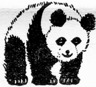
Regd. Trade Mark

Everyone adores them they're so so gay and colourful in a variety of designs :— stripes, spots, checks and tartans. Also self colours in satins, taffetas, failles and petershams. Ask for "Panda" and know you are buying the best.