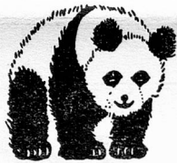
Regd. Trade Mark

Everyone adores them they're so so gay and colourful in a variety of designs :— stripes, spots, checks and tartans. Also self colours in satins, taffetas, failles and petershams. Ask for "Panda" and know you are buying the best.