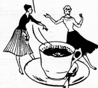
Nescafé is a registered trade mark to designate Nestlé's instant coffee.