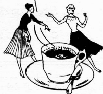
Nescafé is a registered trade mark to designate Nestlé's instant coffee.