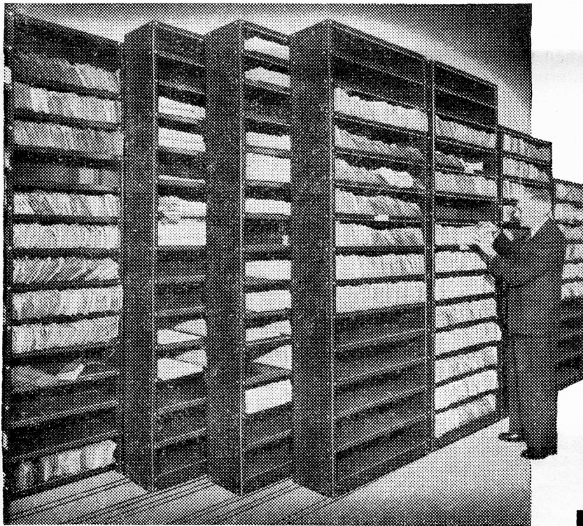
Illustration shows part of Rolstore installation at Northern Assurance Co's Record Office, at Moorgate, London

The Swiss economy was therefore not content to let matters rest last year. On the contrary, with great energy and vision it laid the foundations of its future, well aware that the maintenance of its prosperity depends upon its continuing to play, in the new world that is being created around us, the part it has always played up to now.