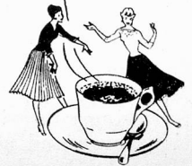
Nescafé is a registered trade mark to designate Nestlé's instant coffee.