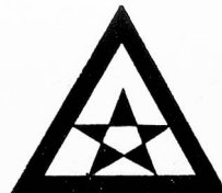
International Association of Master Ladies' Hairdressers