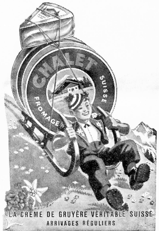
Swiss Chalet Cheese is a real treat for Cheese lovers

? Want a real HOLIDAY ? "With a Difference"