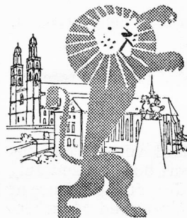
UK — Switzerland flights in association with BEA

EUROPE MIDDLE EAST FAR EAST USA SOUTH AMERICA Offices in LONDON MANCHESTER GLASGOW BIRMINGHAM DUBLIN