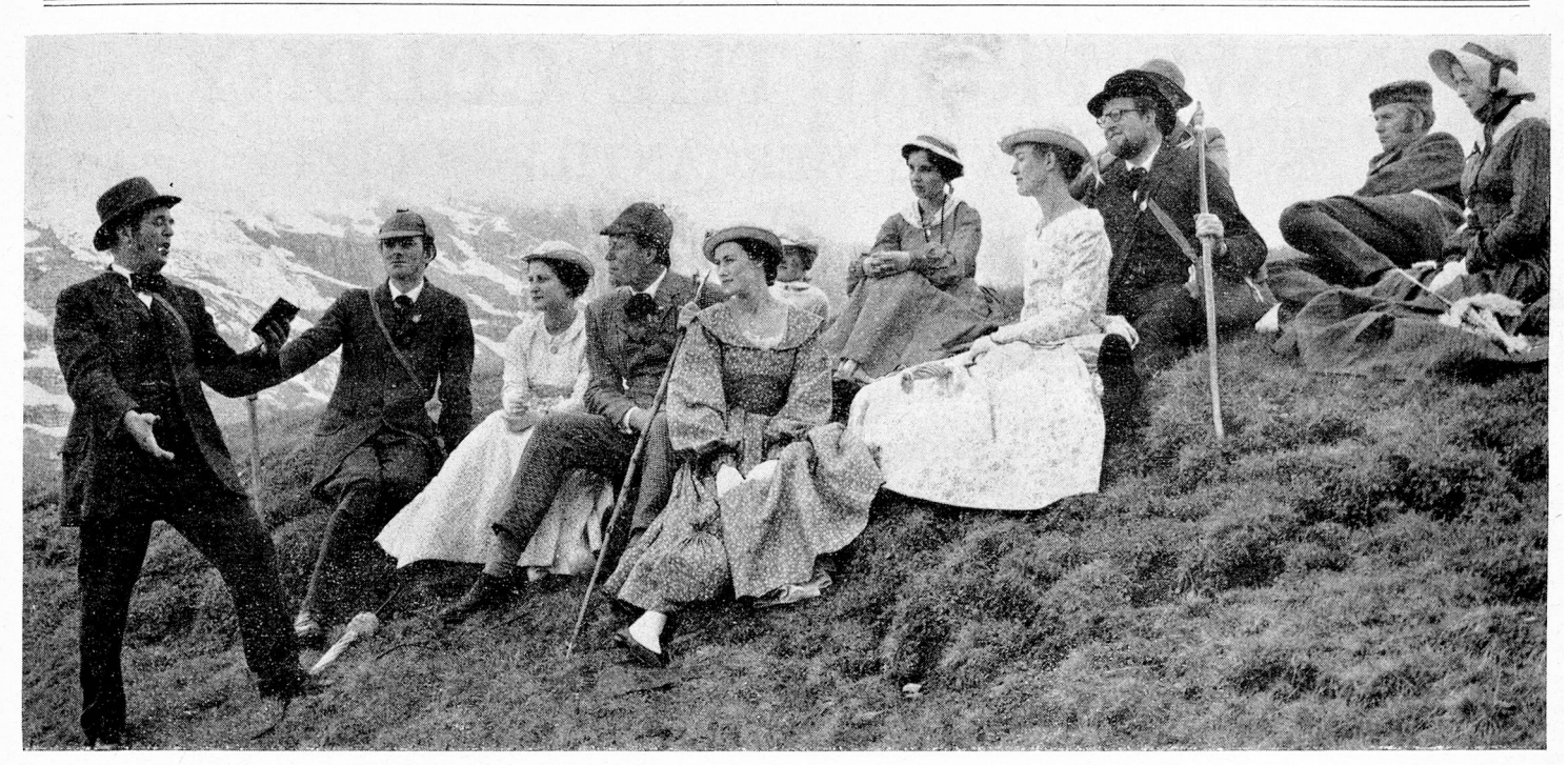
Peaceful scene at Kleine Scheidegg as the travellers rest to listen to the party Paymaster quoting Byron.