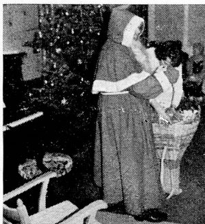
Father Christmas visiting our «Home»-family