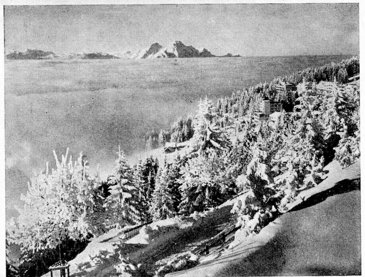
An excursion into the brilliant winter sunshine of the Righi has always been an unforgettable experience for the «Home» guests.

Please write to the Secretary of the «Home» for Swiss nationals living abroad at Dürrenäsch (Aargau/Switzerland) and ask—free of charge and without obligation—for application forms with conditions of admission, etc., or contact your Consulate or your Swiss Club.