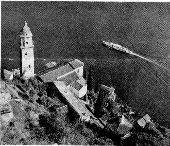
CORALE UNIONE TICINESE

In the true tradition of the Fête Suisse, local talent is included. Who better than the CORALE OF THE UNIONE TICINESE would qualify? For a good number of years this group of singers has entertained the Colony on many occasions. The CORALE, too, has gone through a crisis, but just recently its numbers have been increased considerably and the choir in its picturesque costumes will appear in new strength at the Fête Suisse. I understand its repertoire has been added to by some more attractive tunes from the Ticino and we can be sure of spending a happy twenty minutes listening to songs reminding us of the beauties of Southern Switzerland like this picture showing the Lake of Lugano with the famous church of Morcote.