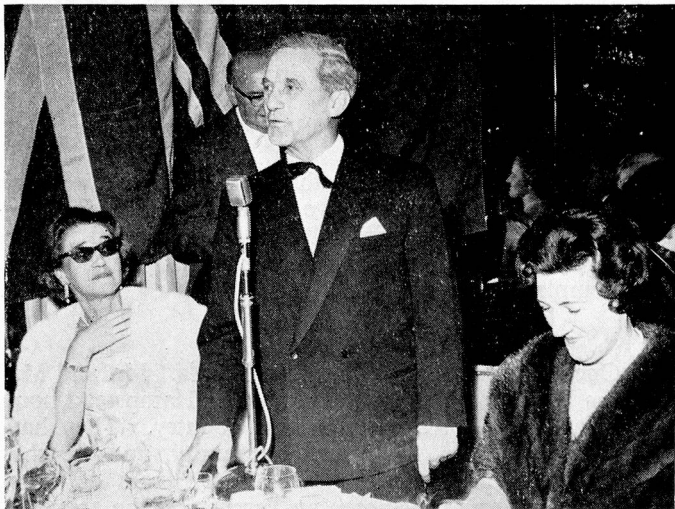
Monsieur le Conseiller Fédéral Roger Bonvin.