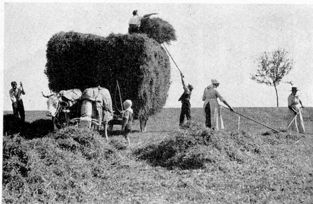
Haymaking: Many hands make light work

The rural woman in Switzerland is reputed to be a hard worker, and this claim is well sustained. Even at normal times, she is "at it" for a long day. When it comes to haymaking and harvest time, potato and fruit picking, heavy demands are made on her time and her physical strength. In spite of improved labour saving and technical devices, the burden has increased, mainly due to migration and lack of paid help. The farmwoman is a workmate of her husband; she cooks large meals for a big family, often comprising two or even three generations and, where help is kept, including farm labourers who eat with the family. The children come home from school at mid-day, and though large families mean more helping hands, it also involves much extra work for the mother by way of cooking, baking and washing. Most important, she is a mother and homemaker and knows how valuable it is to sing with her children and to read to them and tell stories.