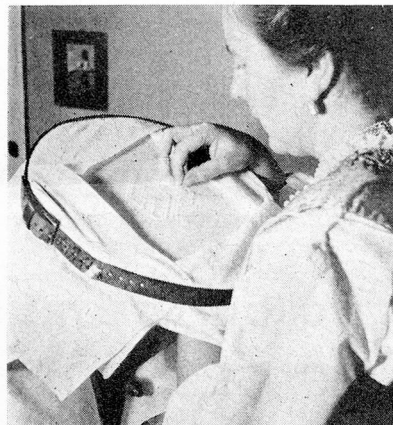
An Appenzell woman embroidering

Approximately one-third of cultivable land is in the mountain regions of the Grisons, Appenzell, the Bernese Oberland and the Valais, usually in very small plots.