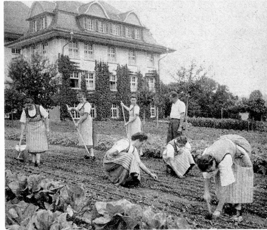
Young Countrywomen attending a gardening course

Some of the activities of the Swiss countrywomen's organisation have already been mentioned. The "Schwei-