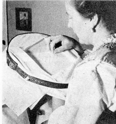
An Appenzell woman embroidering

Swiss agriculture can therefore be described as mainly "family farming". The economic state of the individual farm depends not only on the owner's efficiency or the number in the family, but it is largely due to the wife and mother whether the farm is a thriving concern or a struggling unit eventually doomed to failure. She not only looks after the house, but she tends the vegetable and flower gardens, including the colourful window boxes, an attraction of so many villages. Generally, she is also responsible for poultry and rabbits, and often she minds the pigs as well, and possibly takes an interest in bee-keeping on top of it. She thus plays a considerable part in the self-supporting effort of the homestead, marketing and consequently in the food position of the whole country.