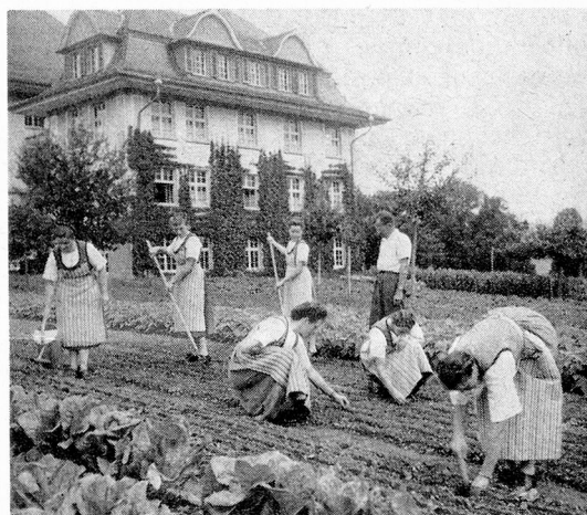
Young Countrywomen attending a gardening course

Some of the activities of the Swiss countrywomen's organisation have already been mentioned. The "Schwei-