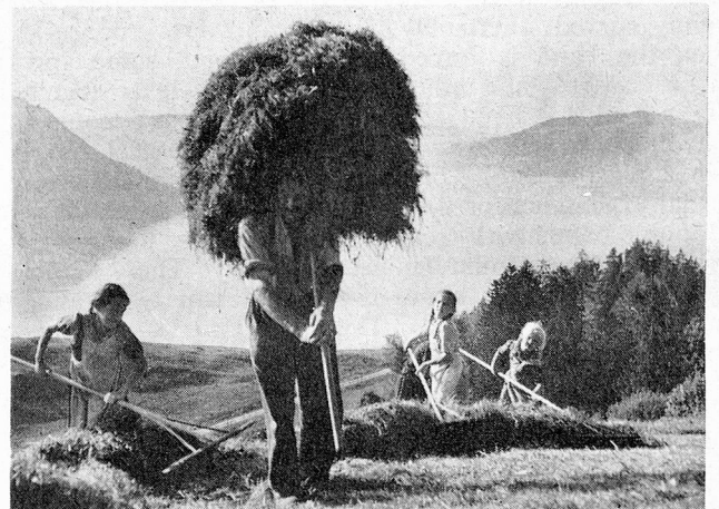
Haymaking above the Lake of Aegeri in Central Switzerland

zerischer Landfrauenverband" was founded in 1932 and has about 36,000 members in seventeen largely autonomous cantonal bodies. Their corporate aim and greatest achievement in recent years is the vocational training of the farmwoman. This starts with classes and courses for young girls, partly in agricultural domestic training colleges. Stiff exams provide the future farmer's wife with a status of a woman who has attained a position and is not "only" a farmwoman. Many farmers' wives later pass the "master test" which in turn entitles them to train young girls. The CWA also instruct farmwomen in improved housekeeping methods and arrange classes for gardening, poultry and rabbit keeping, weaving, etc. It is in no small measure due to this thorough training and the general efficiency of many Swiss countrywomen that, in spite of migration, production has gone up by about 30% in ten years. Every year, some 5,000 acres of the best arable land are lost to building houses and flats, schools, road construction, sports grounds and airfields. More and more machinery is used — every fifth farm has a milking machine. The farms without cattle become ever more numerous, though there are still about 850,000 head of cattle in the country, and annually about 14,000 tons of cheese are exported.