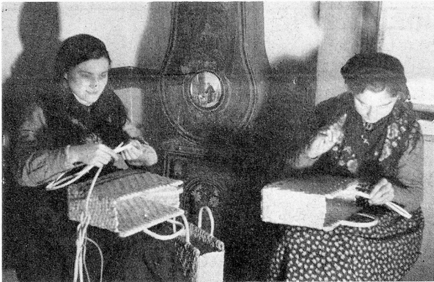
Rural industry: Basket plaiting in the Ticino

The Swiss countrywoman shows a great interest in radio plays, and the number of those reading good books is surprisingly high. But here, too, lack of time prevents her from indulging in reading as in other hobbies such as needlework and embroidery, as well as from taking a more lively interest in public life and welfare work.