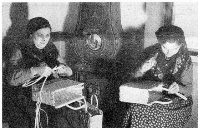
Rural industry: Basket plaiting in the Ticino

The Swiss countrywoman shows a great interest in radio plays, and the number of those reading good books is surprisingly high. But here, too, lack of time prevents her from indulging in reading as in other hobbies such as needlework and embroidery, as well as from taking a more lively interest in public life and welfare work.