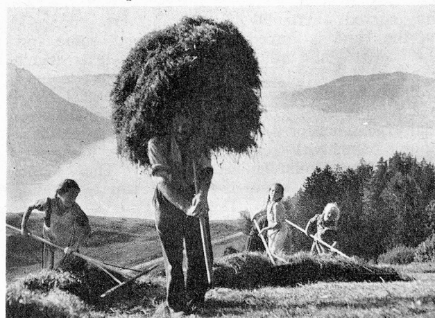
Haymaking above the Lake of Aegeri in Central Switzerland

zerischer Landfrauenverband" was founded in 1932 and has about 36,000 members in seventeen largely autonomous cantonal bodies. Their corporate aim and greatest achievement in recent years is the vocational training of the farmwoman. This starts with classes and courses for young girls, partly in agricultural domestic training colleges. Stiff exams provide the future farmer's wife with a status of a woman who has attained a position and is not "only" a farmwoman. Many farmers' wives later pass the "master test" which in turn entitles them to train young girls. The CWA also instruct farmwomen in improved housekeeping methods and arrange classes for gardening, poultry and rabbit keeping, weaving, etc. It is in no small measure due to this thorough training and the general efficiency of many Swiss countrywomen that, in spite of migration, production has gone up by about 30% in ten years. Every year, some 5,000 acres of the best arable land are lost to building houses and flats, schools, road construction, sports grounds and airfields. More and more machinery is used — every fifth farm has a milking machine. The farms without cattle become ever more numerous, though there are still about 850,000 head of cattle in the country, and annually about 14,000 tons of cheese are exported.