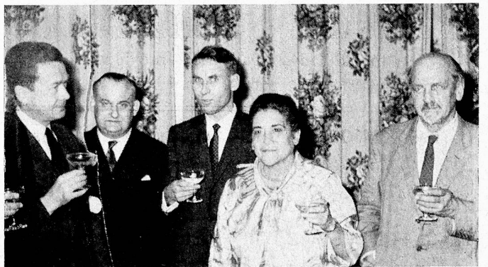
Swiss Cultural Attaché, the Host and Guests