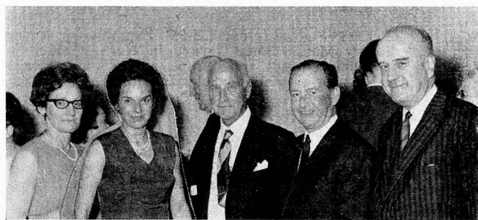
The Hostess with some of her Guests