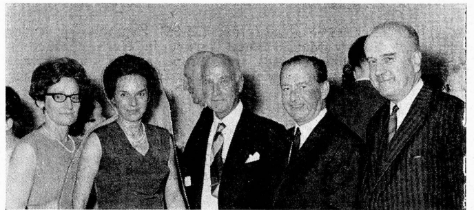
The Hostess with some of her Guests