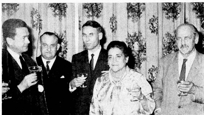
Swiss Cultural Attaché, the Host and Guests