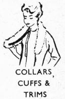
COLLARS, CUFFS & TRIMS

"Velcro" touch and close fastener (a Swiss invention) is made of two Bri-nylon strips which grip firmly at a touch, yet easily peel apart. "Velcro" can be cut with scissors to any length. You can sew it on by hand or machine. It can be washed and dry-cleaned. Cannot jam or rust.