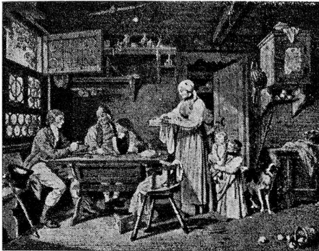
The Home is open all the year round