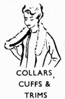
COLLARS, CUFFS & TRIMS

"Velcro" touch and close fastener (a Swiss invention) is made of two Bri-nylon strips which grip firmly at a touch, yet easily peel apart. "Velcro" can be cut with scissors to any length. You can sew it on by hand or machine. It can be washed and dry-cleaned. Cannot jam or rust.