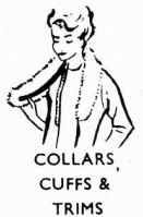
COLLARS, CUFFS & TRIMS

"Velcro" touch and close fastener (a Swiss invention) is made of two Bri-nylon strips which grip firmly at a touch, yet easily peel apart. "Velcro" can be cut with scissors to any length. You can sew it on by hand or machine. It can be washed and dry-cleaned. Cannot jam or rust.