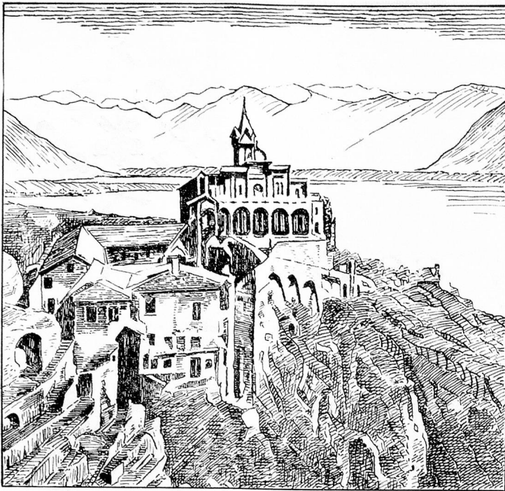
Locarno: La Madonna del Sasso

ing the church, the magnificent panoramic view of the country can be admired.