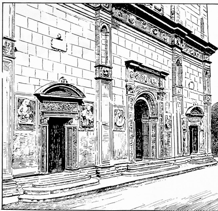
Lugano: San Lorenzo Cathedral

Of all Lugano's churches, the ancient church of Santa Maria degli Angioli (St. Mary of Angels) constructed in 1499, deserves a visit. The wall separating the interior in two parts, holds the celebrated fresco-painting of the Ticinese Bernardino Luini (1470-1533) who was a pupil of Leonardo da Vinci; his angel and woman faces, sweet and meditative, have more charm than those of his master. His famous Passion is of 1521 date. A gracious Madonna (1530) and the Lord's Supper, of beautiful and warm colouration (1533).