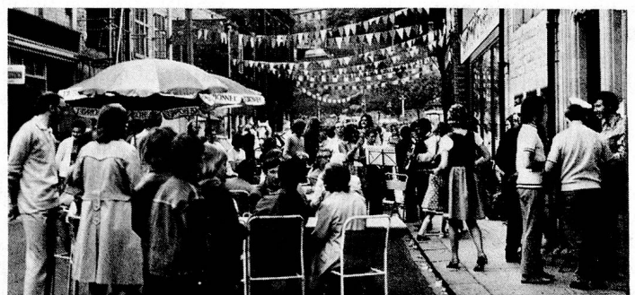
Swiss Week Festivities (Halifax Courier).