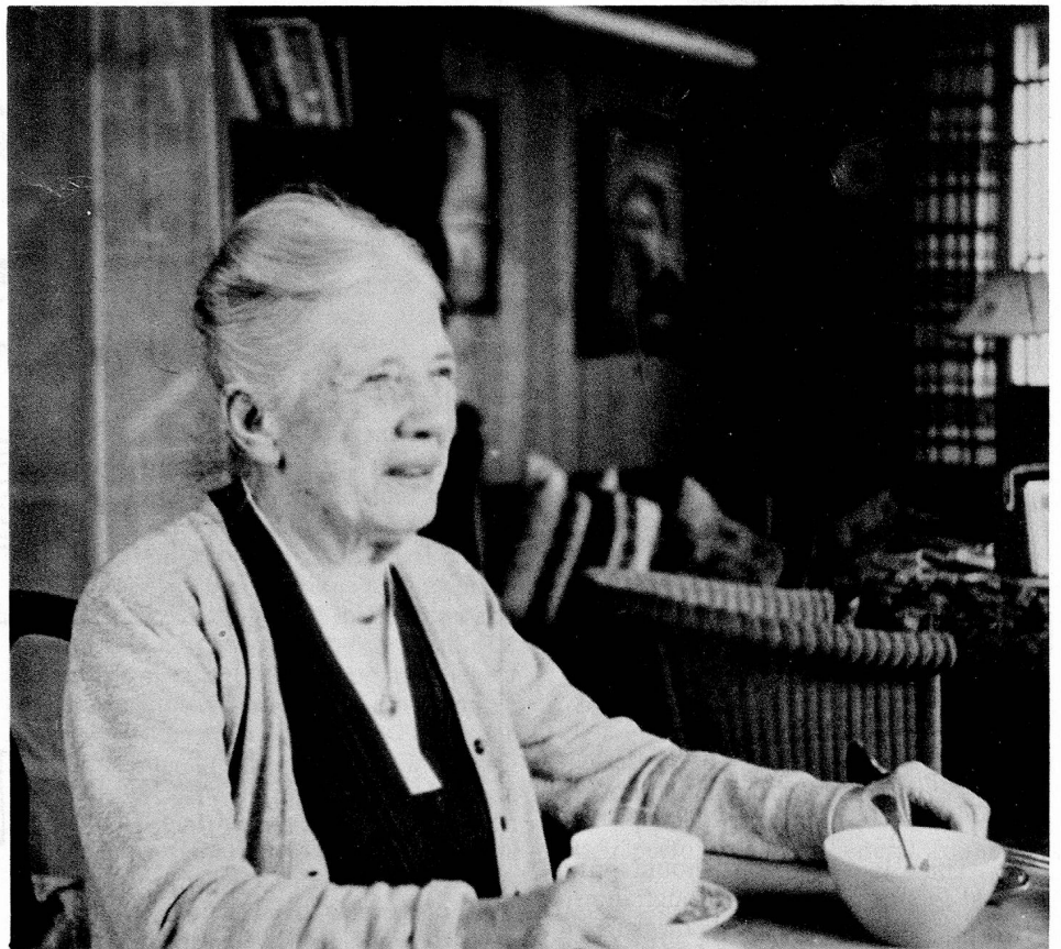
The peace of retirement

4. Further details appear in the "Leaflet on the voluntary insurance scheme for Swiss citizens resident abroad", which has just been reissued and takes account of the situation as from 1st January 1973. This leaflet can be obtained from any Swiss diplomatic or consular mission.