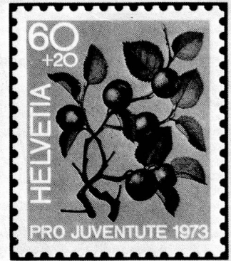
Edelkastanie Châtaigne Castagna