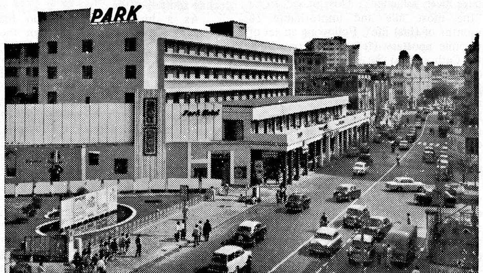
Street in Calcutta

The largest patisserie we have seen in India, a place called Wenger at Connaught Circus, in the centre of Delhi, might well have been of Swiss origin judging from the name and some of the continental cakes on sale. Owing to the presence of a large crowd of buyers, it was not possible to get confirmation from the Manager.