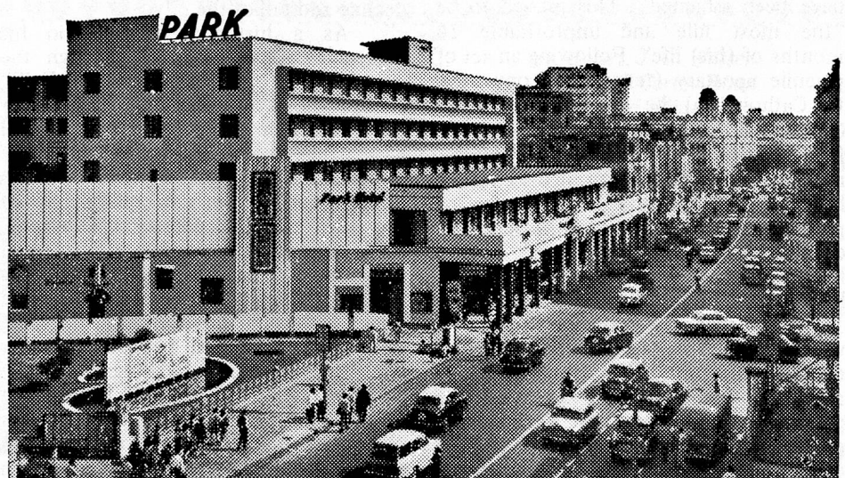
Street in Calcutta

The largest patisserie we have seen in India, a place called Wenger at Connaught Circus, in the centre of Delhi, might well have been of Swiss origin judging from the name and some of the continental cakes on sale. Owing to the presence of a large crowd of buyers, it was not possible to get confirmation from the Manager.