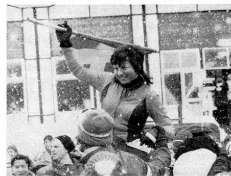
Sapporo, 5th February, 1972: Swiss schoolgirl Marie-Therese Nadig lifted shoulder high by her supporters after her surprise win in the women's downhill event of the 1972 Winter Olympics.

It is hoped that there will be stronger athletes for the next Olympic Games and, who knows, possibly even some new stars.