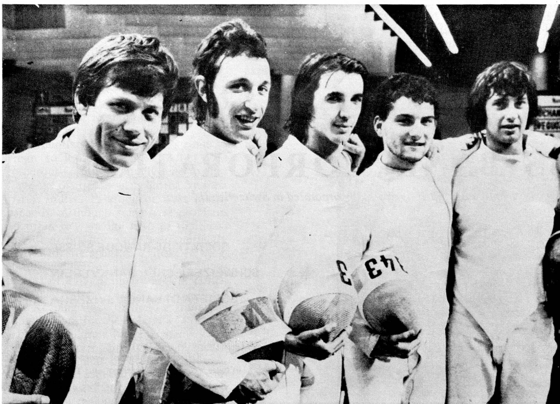
The triumphant silver medallists in épée fencing