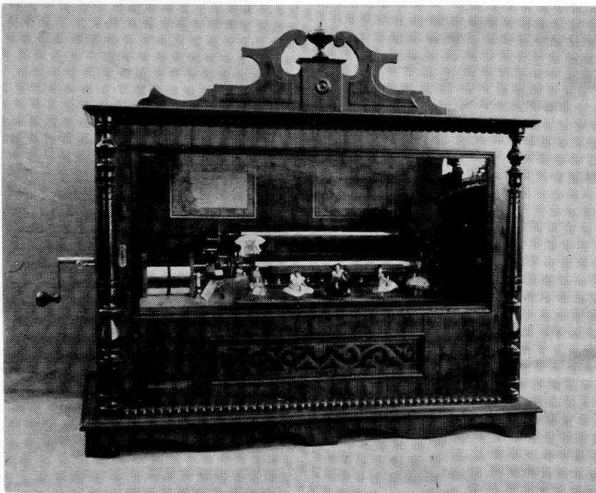
Luxury musical box manufactured in St. Croix in 1900.