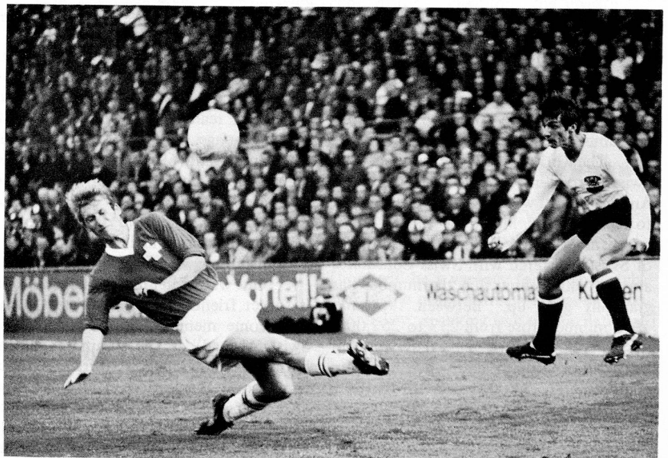
During the Switzerland-Austria match of 22nd September 1968. The Swiss won 1-0.