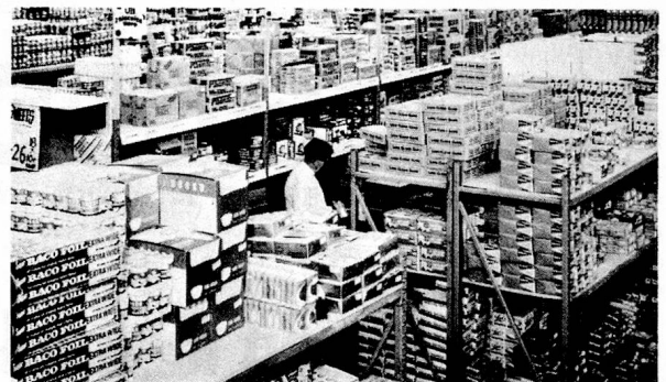
Series 70 MEDIUM DUTY 8,000 lbs. PER FRAME Racking for non-palletised merchandise. Clear spans up to 8 ft.

Acrowracks can be installed or adjusted to suit changing requirements quickly and at low cost. Find out more about them, telephone your nearest Acrow Branch Office today.