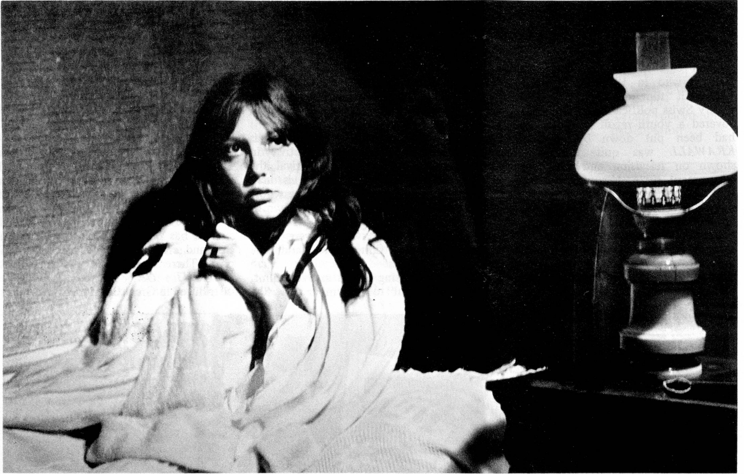
Scene from "The Extradition" (by courtesy of Barbera Bernet, Lucerne).

Apart from the perennial problem of financing, the severely limited domestic market is the chief handicap of Swiss films. If independent film-making is to continue to grow in Switzerland the film-makers must set their sights beyond the admiration of a small "in-group" and try to gain the confidence of the general audience.