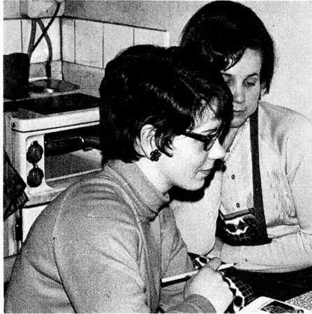
Young Swiss in the kitchen of the Swiss Club enjoy their supper.