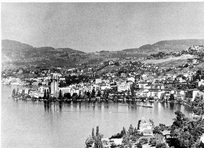
General view of Montreux.