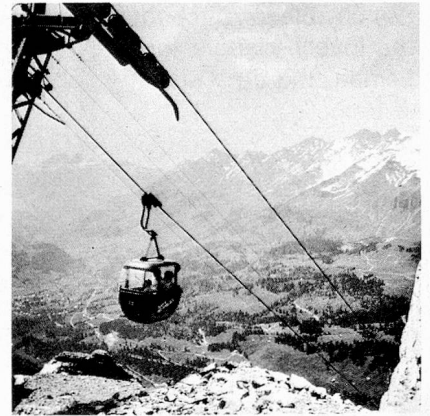
View of the massive of the Diablerets.

In the economic field, the Canton has been successful in keeping a balance between agriculture, trade and industry, and this has enabled it to achieve outstanding performances in all three sectors. Its agricultural colleges and research institutes are well-known all over Switzerland, the quality of its vintages is first-class. A whole series of undertakings in the precision industry are world-renowned; the insurance companies, the Vaudois banks – amongst them several private banks – enjoy an excellent reputation.