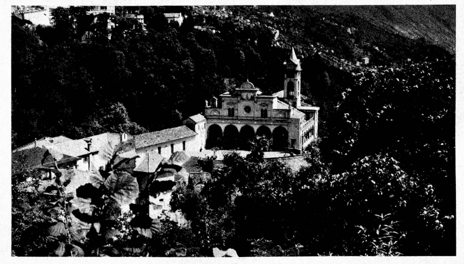
The pilgrimage church of Madonna del Sasso above Locarno

Switzerland first entered literature in songs of battle. Then with the Reformation came a surge of political writing. Broadsheets and moralities or religious plays took the historical situation as their cue. Later nature was discovered, the landscape, the idyll, the earthly Paradise. Into this idyll irrupted the misery of the early industrial age.