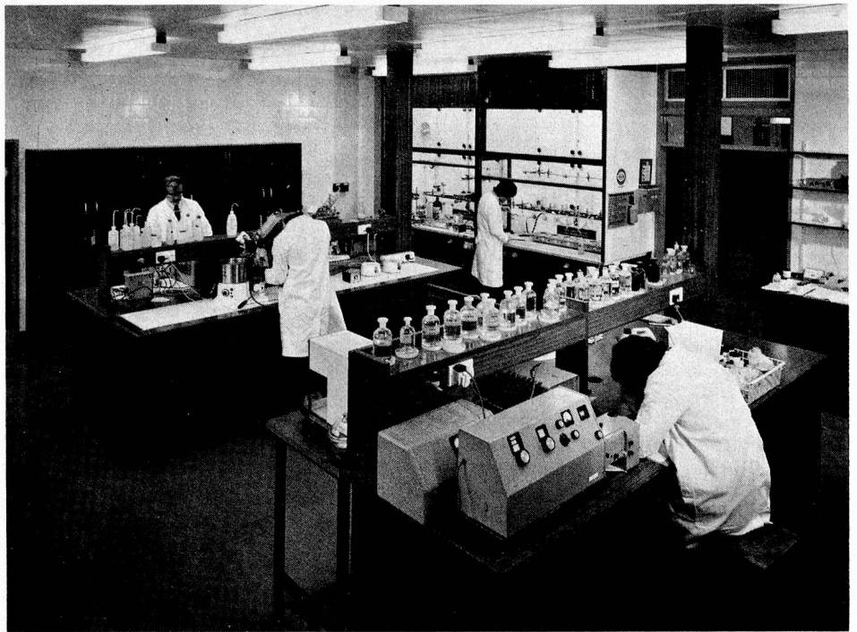
General view of a quality control laboratory in the new laboratory block at Ciba-Geigy Agrochemicals headquarters at Whittlesford, Cambridge.

The representative office will be at 66 Hanover Street, Edinburgh EH2 1HH.