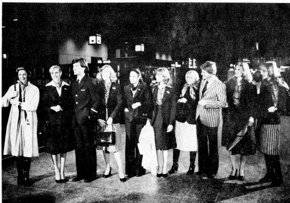
An attractive line-up shows the new Swissair uniforms.

The new ensemble is the result of a two-year trial and selection process. In its final stages seven uniform creations by different designers were tested on regular