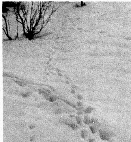
The tracks of a cat and a deer.