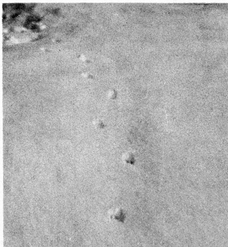
The tracks of a domestic cat.