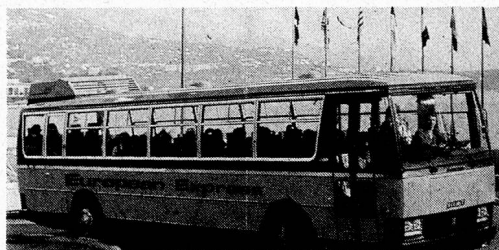
One of our Luxury air-conditioned coaches

Departures every Saturday from March to September and also Wednesdays during July and August.