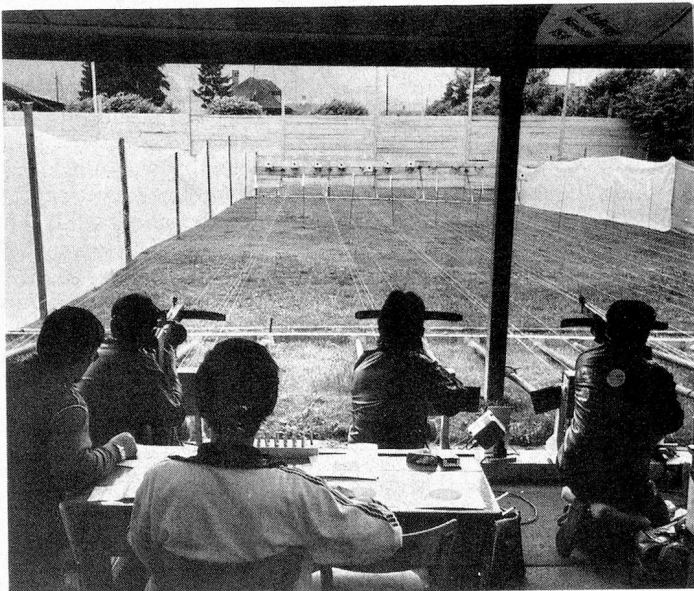
Sidescreens of plastic or fabric are used to reduce wind effects.