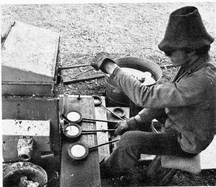
Pouring lead for the targets