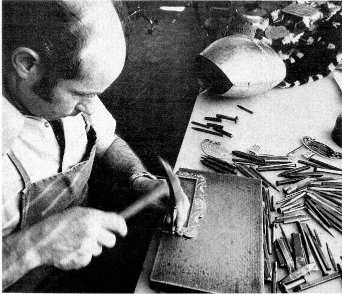
A hammer and various punches are needed for the delicate engravings on the brass buckles.