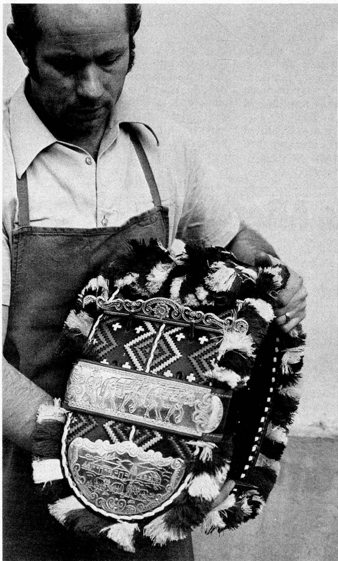
It takes some 25 hours of meticulous work to finish one of the bell straps with leather laces, woollen frills and brass engravings.

Should you feel that your Business Travel, Conferences, Freight and Holidays, could be better than they are, we offer two words of comfort Rankin Kuhn