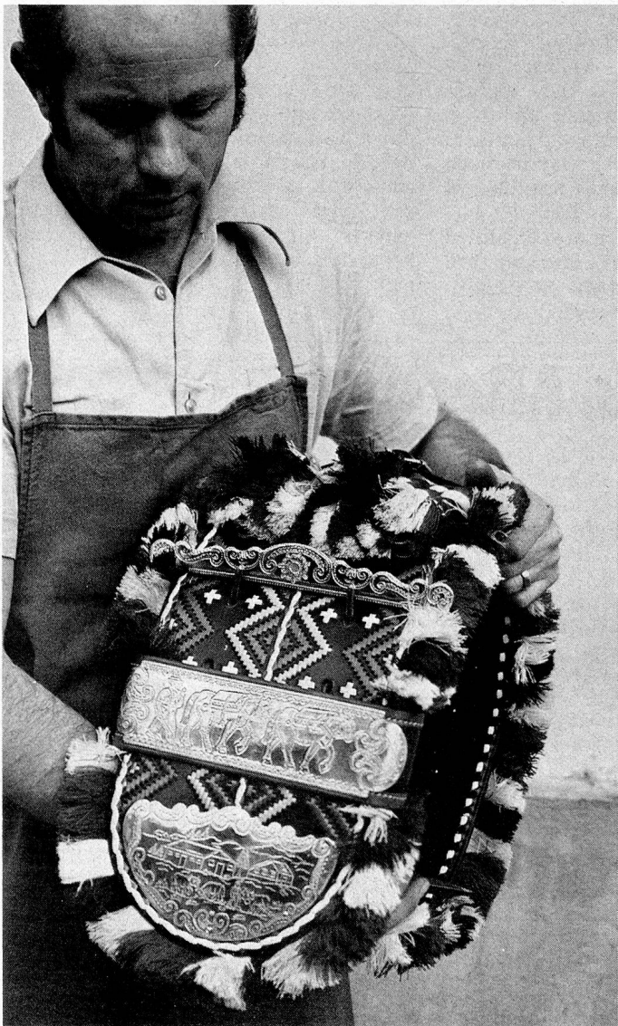
It takes some 25 hours of meticulous work to finish one of the bell straps with leather laces, woollen frills and brass engravings.

Should you feel that your Business Travel, Conferences, Freighting and Holidays, could be better than they are, we offer two words of comfort Rankin Kuhn