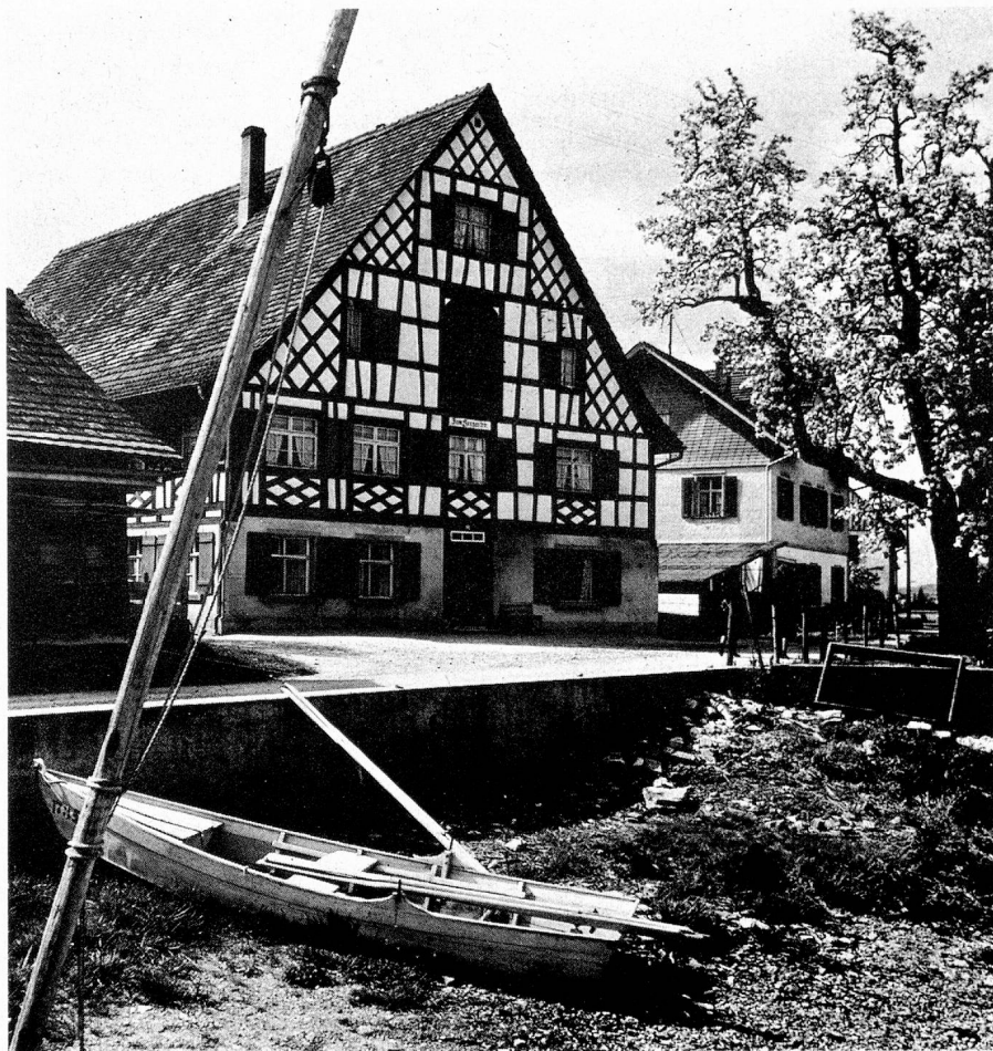
Home with typical frame and fill work architecture in Ermatingen

Already 2800 B.C., the first men settled in this part. The marsh settlements of the neolithic age at Egelsee near Niederwil and Breitenloo to the West of Pfyn belonged to the Pfyn Culture. These people of neolithic times, who were tillers and cattle breeders, were followed in turn by immigrants of various kinds, as the string potters in about 1800 B.C., traders from the South in the Bronze Age, and the Celts in the Hallstatt period. And then, the sparsely populated country on the Lake of Constance belonged to the Roman Empire for over 400 years: brick-making, masonry, fruit- and wine-growing were introduced; generously constructed trade and military routes connected places like Arbor felix (Arbon), Ad fines (Pfyn) and Tasgaetium (Eschenz) with the Midland network. Roman soldiers settled in the forts. Later, the Alemans immigrated and penetrated the area; they gave the country their language, their style of living and building. The Franconian «Gau» organisation knew a Thurgau for the first time; at the beginning, it comprised a quarter of Switzerland, known as the Pagus Durgaugensis according to a St. Gall document of 744. From the earldom as geographical term evolved a judiciary and administrative district. The earldom titles were vested in the House of Kyburg, and from 1264 onward with their heirs, the Habsburgs. The political unity of the Thurgau is owed to their strict leadership. In 1460, the strong and mighty Confederates incorporated the