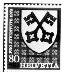
Wangen a. d. A. (BE)