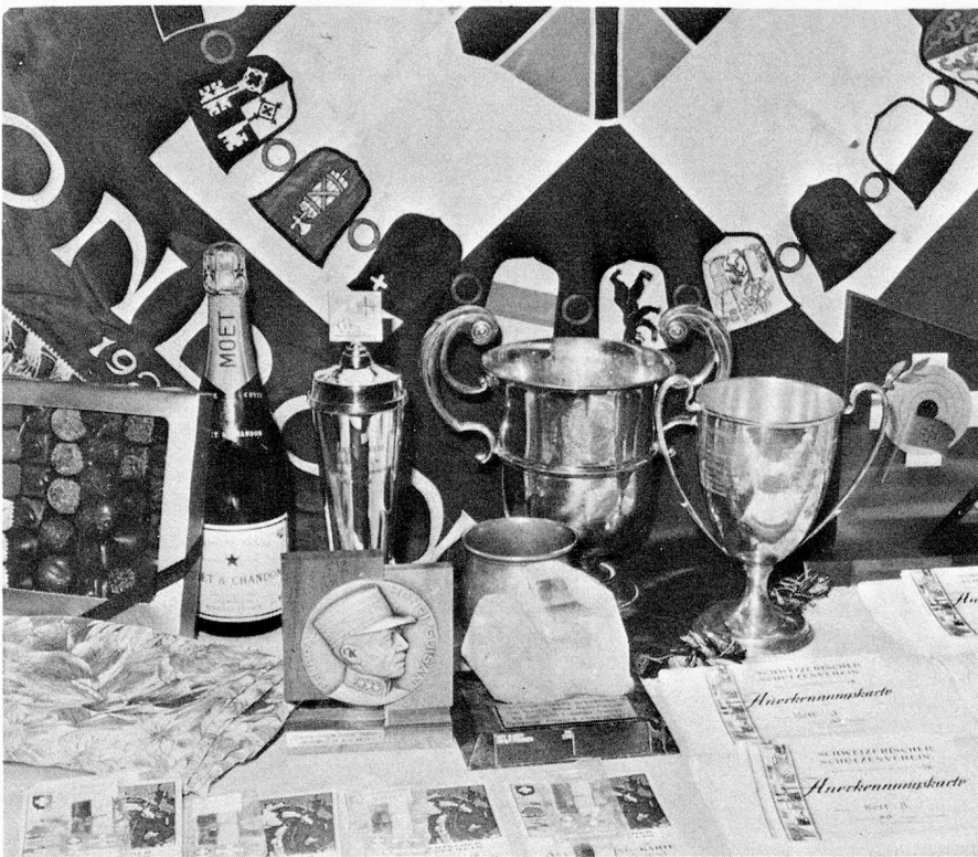
No wonder competition is so keen when cups, trophies, and other goodies like these are at stake!