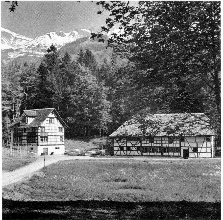
On the Ballenberg near Brienz an open-air museum on farm culture has been established in a 50 hectare park. The museum displays some of the most important settlement patterns in Switzerland.

The idea of open-air museums came from Scandinavia, that is to say museums of rural buildings and other installations which show lifestyles and rural culture of times gone by. The houses are grouped according to region, and we find a multi-purpose building dating to 1797 from Ostermundigen with a granary, a half-timbered house, a "Hochstudhaus", from Madiswil, which was originally built in 1710 and has been added to by a granary from Kiesen. There is a retired farmer's cottage with an oven, from Detligen and a field barn (1702) from Faulensee. The ovenhouse from Oberwangen serves as the ticket office. The "Alter Bären" from Rapperswil (Berne) houses the restaurant today. An old house from Adelboden (end of seventeenth century) has a boiler for pigfeed. In the group of Eastern Switzerland we find a house from Richterswil, Zürich, probably from 1770 and a multi-purpose building from Ueslingen in the Canton of Thurgau. There are some more, most of which are open to the public, and various crafts like basket making, weaving, lath-box making, spinning and charcoal burning are shown.