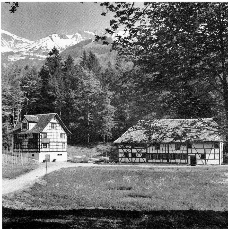
On the Ballenberg near Brienz an open-air museum on farm culture has been established in a 50 hectare park. The museum displays some of the most important settlement patterns in Switzerland.

The idea of open-air museums came from Scandinavia, that is to say museums of rural buildings and other installations which show life-styles and rural culture of times gone by. The houses are grouped according to region, and we find a multi-purpose building dating to 1797 from Ostermundigen with a granary, a half-timbered house, a "Hochstudhaus", from Madiswil, which was originally built in 1710 and has been added to by a granary from Kiesen. There is a retired farmer's cottage with an oven, from Detligen and a field barn (1702) from Faulensee. The ovenhouse from Oberwangen serves as the ticket office. The "Alter Bären" from Rapperswil (Berne) houses the restaurant today. An old house from Adelboden (end of seventeenth century) has a boiler for pigfeed. In the group of Eastern Switzerland we find a house from Richterswil, Zürich, probably from 1770 and a multi-purpose building from Ueslingen in the Canton of Thurgau. There are some more, most of which are open to the public, and various crafts like basket making, weaving, lath-box making, spinning and charcoal burning are shown.