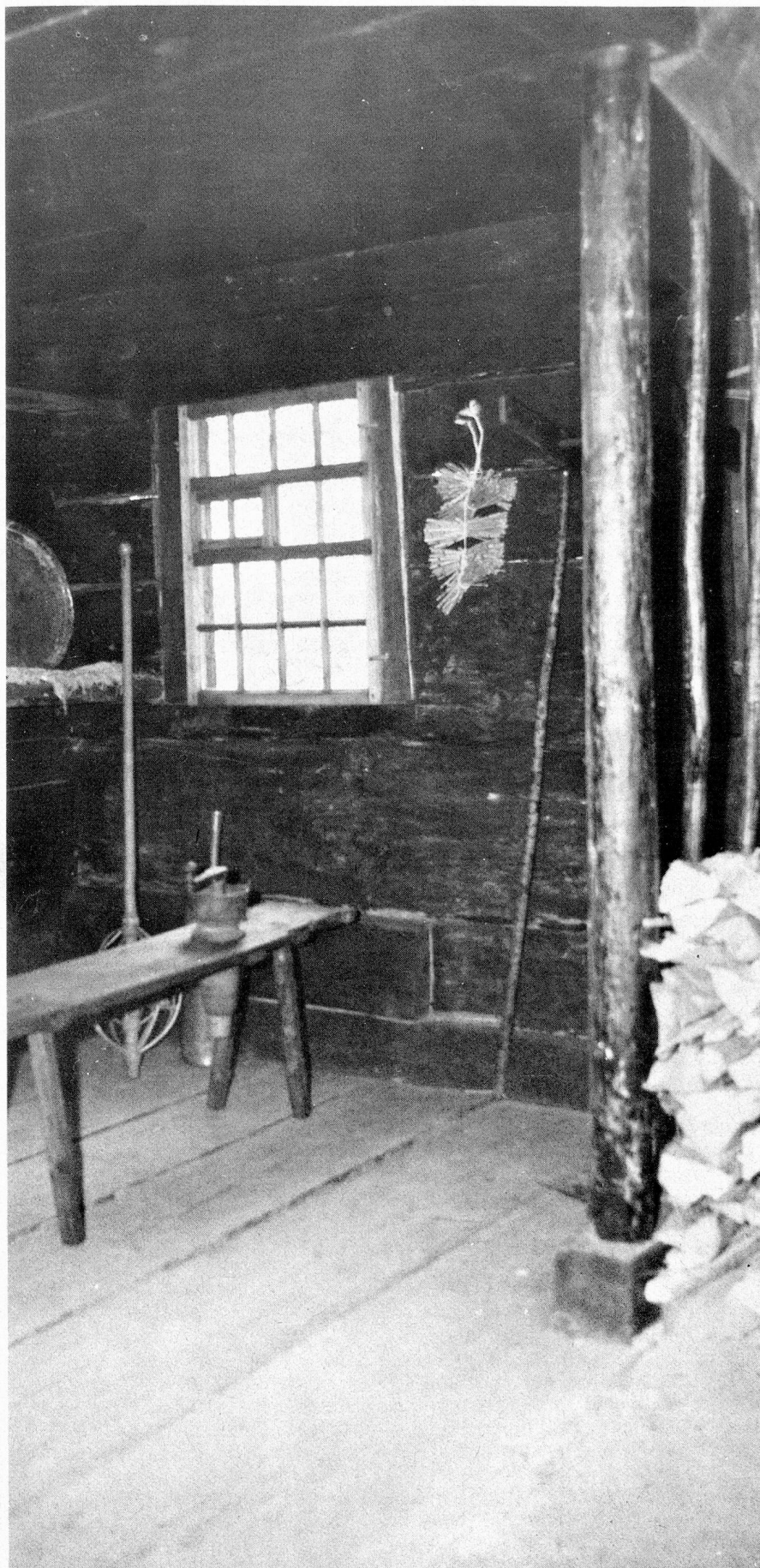
A charming glimpse inside an old farm house is one of the charms of the Ballenberg museum.