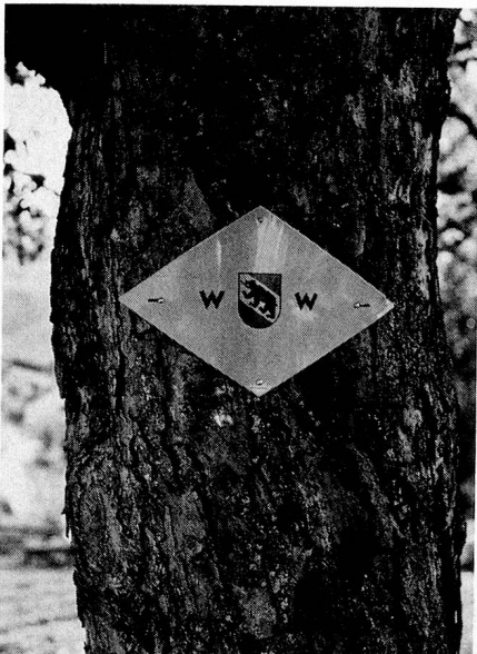
A typical sign on one of our many hiking trails. The author admits having welcomed some of these on his expedition!

The wooden chalets, shuttered and long-eaved as precaution against winter snow, were just as practical in summer. They looked cool and dark inside. The bars were particularly inviting, though at this stage I was still energetic enough to buy lemonade from village stores and to drink on the move. And the meadows behind were perfect.