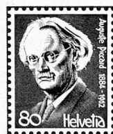
Auguste Piccard 1884-1962 Physiker Fisicien Fisico