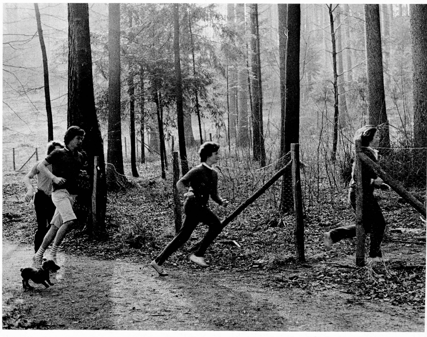
ALONG THE TRAIL

This information (with pictures) on Vita Parcours facilities in Switzerland was provided by the Swiss National Tourist Office.