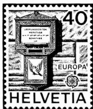
Historischer Briefkasten aus Basel Boîte aux lettres historique de Bâle Buca delle lettere storica di Basilea