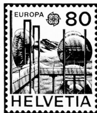
Alpine Relaisstation Jungfrauoch Station relais alpine du Jung- frauoch Ripetitore d'alta montagna dello Jungfrauoch