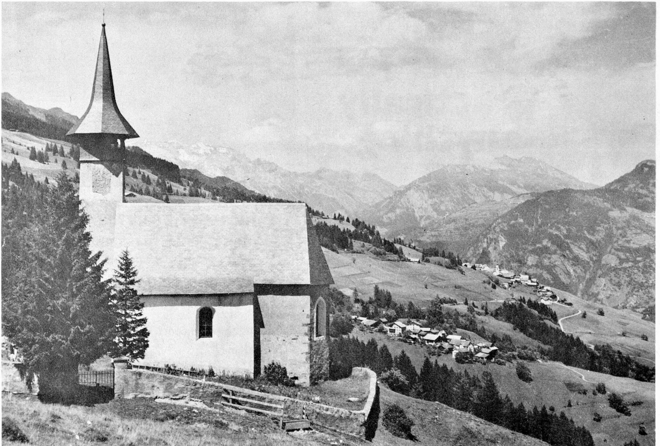
Church in the Lötschental

Of course, soon comes the dangerous descent — back into the valley and to everyday life. But you will take home an unforgettable experience, which gives you strength for weeks or months. You will try to put it into words, let your friends down in the valley share it — and you can't. Some may politely share your happiness, a few who have had a similar experience will understand. Others, probably the majority, might think you are mad. And you will be silent about it but for those who understand. But you may well be hooked and long for a next occasion!