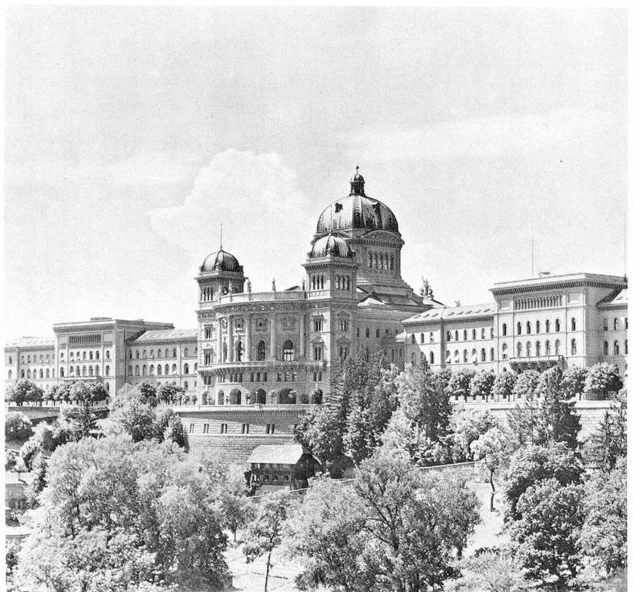
Berne, The Houses of Parliament

In order to understand this fully one has to recall some of the basic features of Swiss government. The Federal Council comprises seven members of basically equal status. They are chosen for a period of four years, and each year the legislature appoints the most senior member (customarily) for a one-year term, non-renewable, as the cabinet's chairman, which amounts to the titular role of Head of State. The President of the Confederation, as he is then called, has only formal powers – besides some very narrow emergency powers – over his cabinet colleagues. He acts as a "primus inter pares", remaining in essence an ordinary minister with his portfolio. The overall responsibility of government is shared by the cabinet as a body – what may be termed the "collegial system".