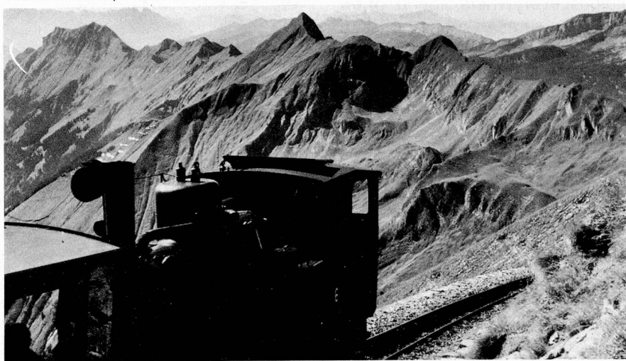
The rack-railway to the Brienzer Rothorn, operational since 1892

With a per capita income of a little over Fr. 18 000.- as compared to the Swiss average of approximately Fr. 20 000.-, the Canton of Berne belongs to the economically less favoured Cantons of Switzerland. The process of restructuring in the watch industry has caused considerable problems in the Bernese Jura. The high rate of exchange of the Swiss Franc also causes worries to the tourist industry, for the Canton of Berne (after the Grisons) has available the second-largest number of hotel beds. The future of the Bernese economy need, however, not be judged too pessimistically. Thanks to its central position and the newly constructed network of national motorways, the Canton of Berne is easily accessible. The projected improvement of the Loetschberg line by making it double-track will also contribute towards enhancing the Canton's attraction for business undertakings. Local planning in the Communes, now largely completed, and ecological development concepts for the various regions will create a well-balanced structure which is in keeping with the needs of the economy