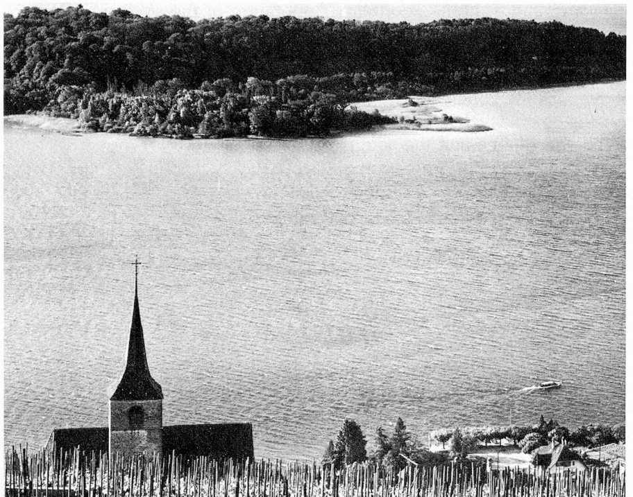
The village of Ligerz with a view of the Isle of St. Peter where Jean-Jacques Rousseau lived in 1765